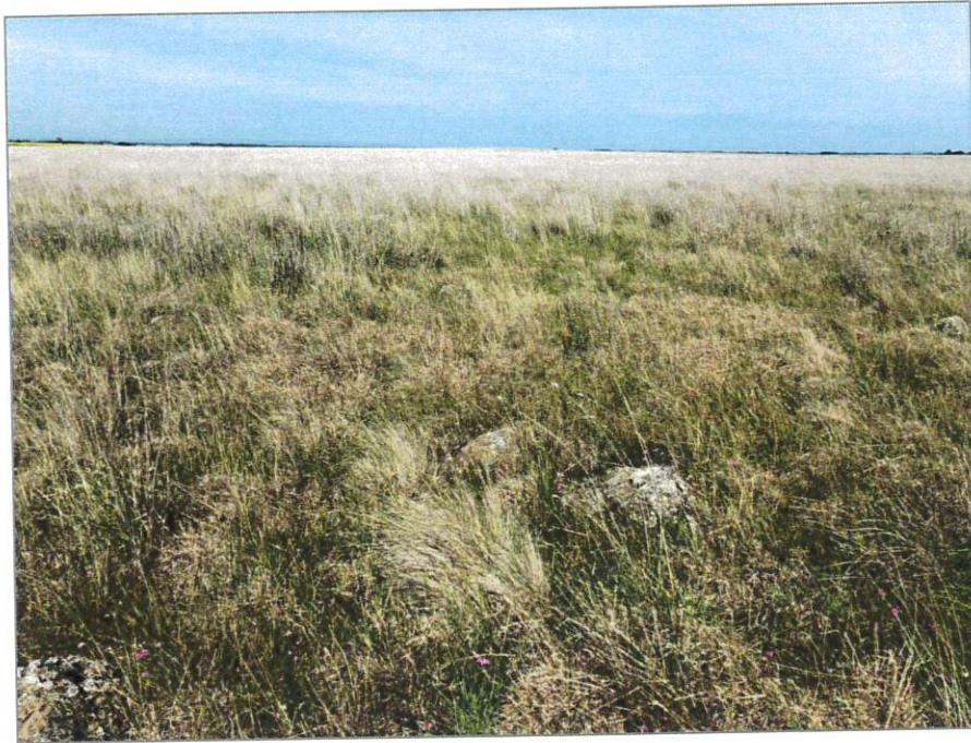
Zone 14, dominated by Kangaroo Grass and Toowoomba Canary-grass, the latter also surrounding and encroaching. Onion Grass cover also high.