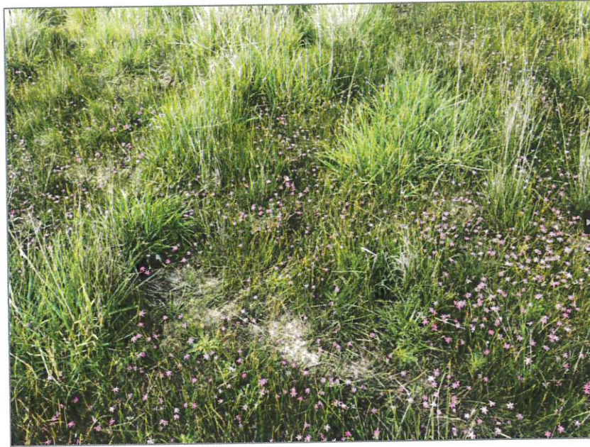
Zone 31: Very high cover of weeds including Toowoomba Canary-grass, Onion Grass and Flatweed.