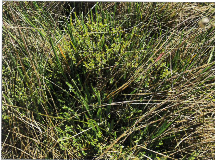
Zone 20: Spiny Rice-flower with Narrow Plantain in dense biomass including Toowoomba Canary-grass and Onion Grass.