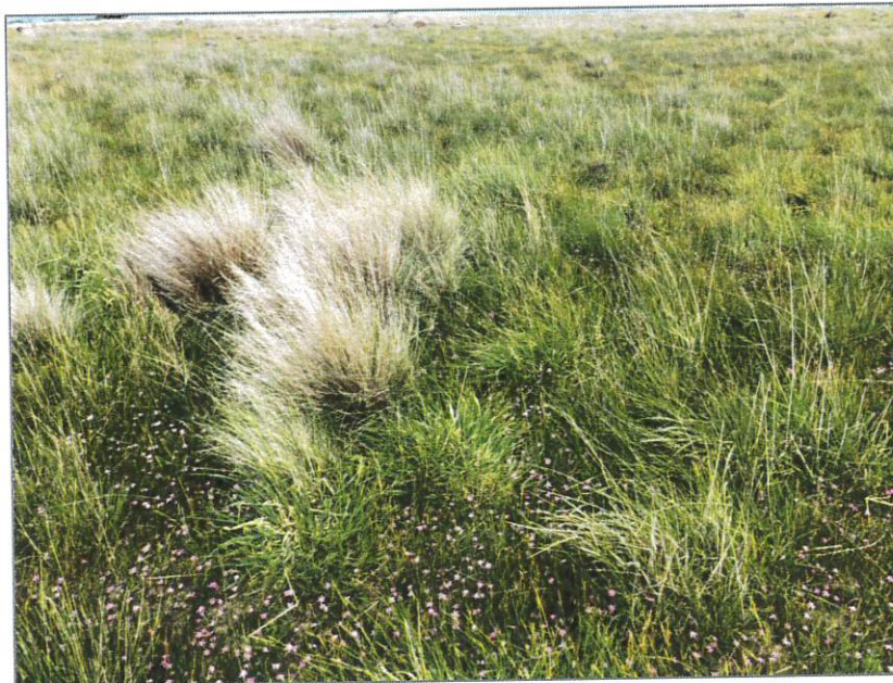
Zone 40: Toowoomba Canary-grass and Onion Grass encroaching.